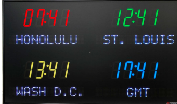
Model 6612U - 4.0" time, 2.0" zone labels, 4 zones